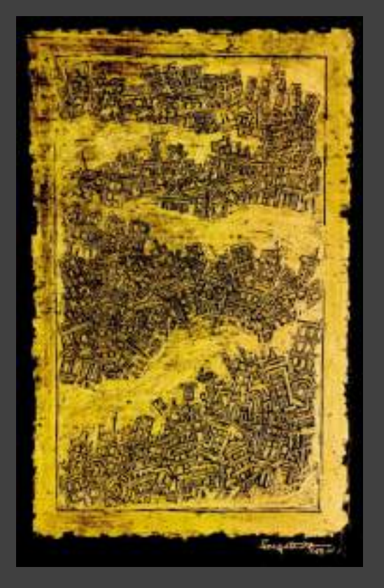
Flood

The ethnovisual approach in its new avatar 'ethno-graphy' is re/establishing its application rationale for exploring dynamic socio-ecological settings of diverse geographies. Combining qualitative research with visualization techniques, arts-based pedagogies are being widely appreciated and applied by interdisciplinary researchers in capturing and disseminating complex and vibrant socio-ecological narratives from the ground. As part of the Water and Development Partnership (IHE Delft, Netherlands) funded AQUAMUSE initiative and with a focus on the Sundarbans Delta, this workshop will expose participants to critical ethnovisual pedagogies, comprising theories, case studies, and hands on activities. The participants will engage in joint project presentations and the best project(s) would also entail possibilities to join AQUAMUSE as interns (for winter 2024-25).