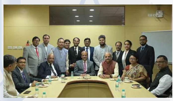
Inauguration by Hon'ble Mr. Justice Rajesh Bindal Judge, Supreme Court of India