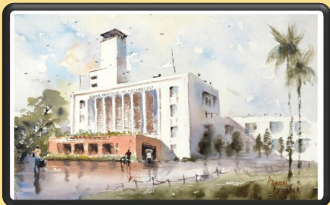
IIT Kharagpur Main building

The University of Bradford, located in West Yorkshire, UK, is a prestigious institution with a rich history of academic excellence and innovation. Established in 1966, it is globally recognized for its cutting-edge research and high-quality teaching in diverse disciplines, including health, engineering, business, social sciences, and technology. The university is renowned for its Institute of Cancer Therapeutics (ICT), which has been at the forefront of cancer research since the 1950s. The ICT specializes in developing targeted cancer therapeutics through expertise in drug discovery, medicinal chemistry, pharmacology, and molecular biology. With a strong commitment to sustainability, community engagement, and global collaboration, the University of Bradford fosters an inclusive learning environment that equips students and researchers with the skills to address real-world challenges and make a meaningful impact on society.