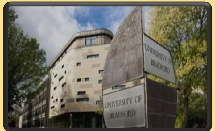
University of Bradford, UK