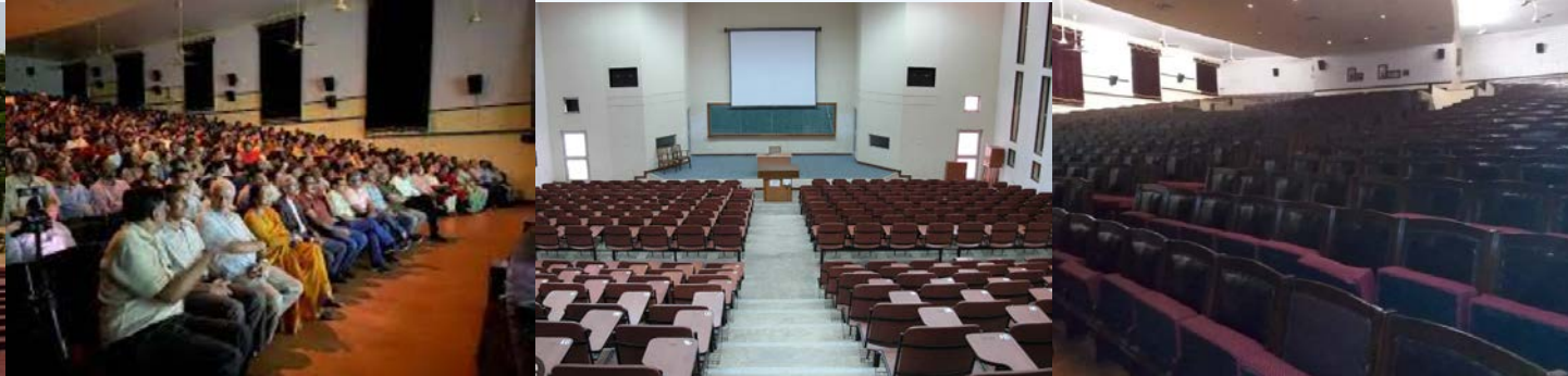
Vikramshila auditorium complex