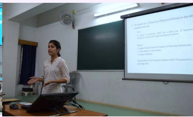
Nalanda classroom complex with full audio/ video facilities